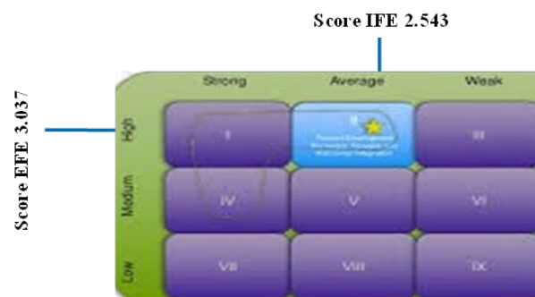
Figure 2. Kinarya Jaya Tour & Travel IE Matrix

Table 2 is an external factor matrix table. The external factor matrix table consists of opportunity and threat factors. The score on the opportunity factor is 2.124, while the score on the threat factor is 0.913. These results indicate that business opportunities are greater than the threats experienced by Kinarya Jaya Tour & Travel. The overall total score of this external factor matrix is 3,037.