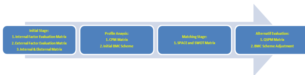
Figure 1. Stages of method use

The research method describes the steps taken to apply the method as a whole in determining the marketing strategy.